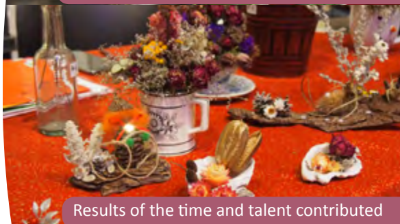
Results of the time and talent contributed