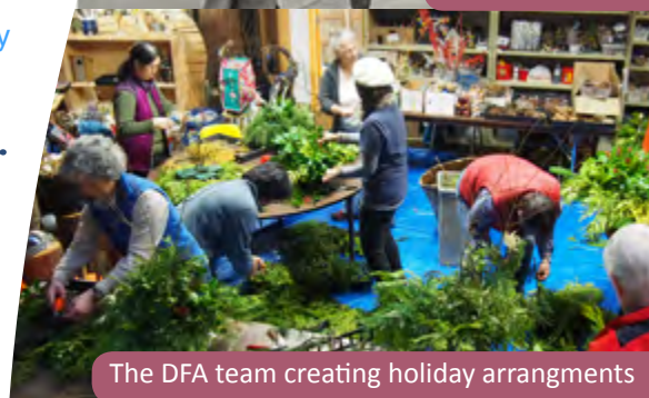
The DFA team creating holiday arrangements