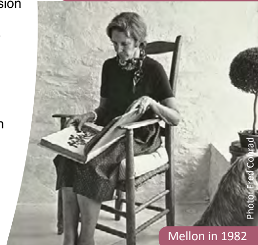
Mellon in 1982